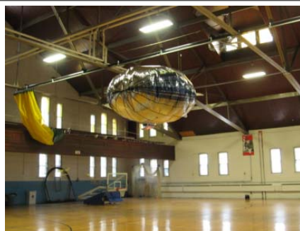
UFO at the Armory?