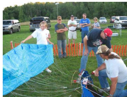
The Ashby's R/C Parasail getting fire d up