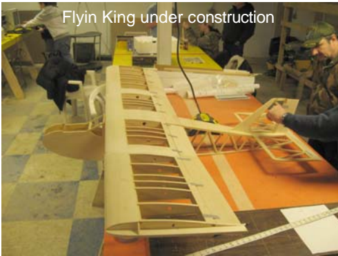
Flyin King under construction