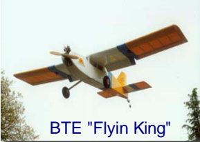
BTE "Flyin King"